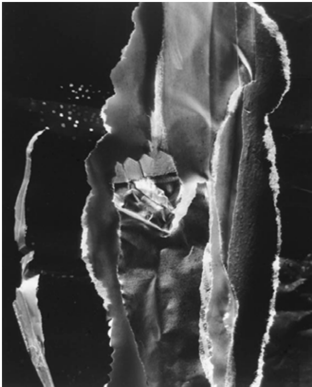
#3 Heidi's Garden, 1991