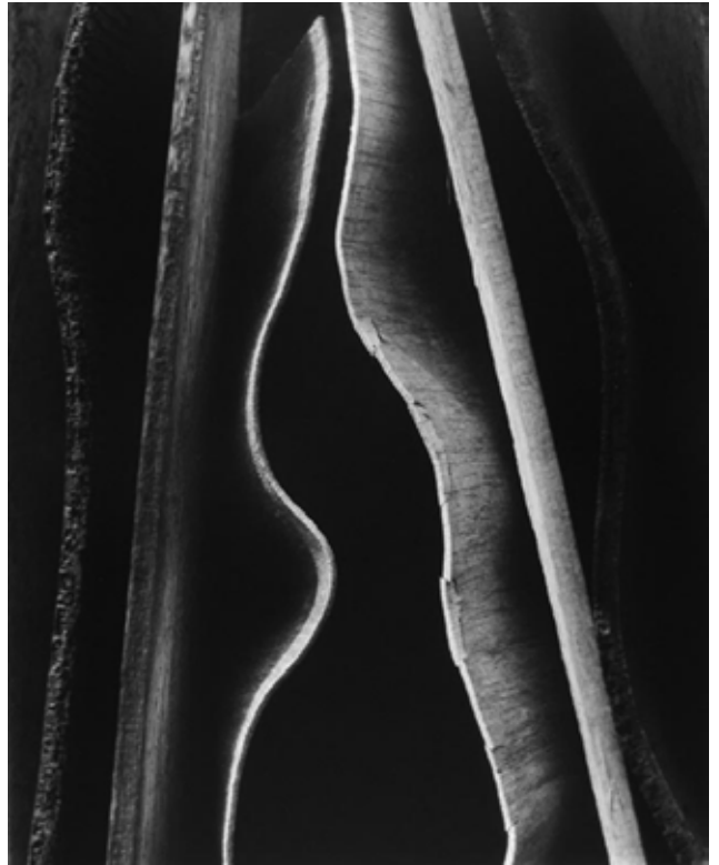
#2 Rockland, 1979