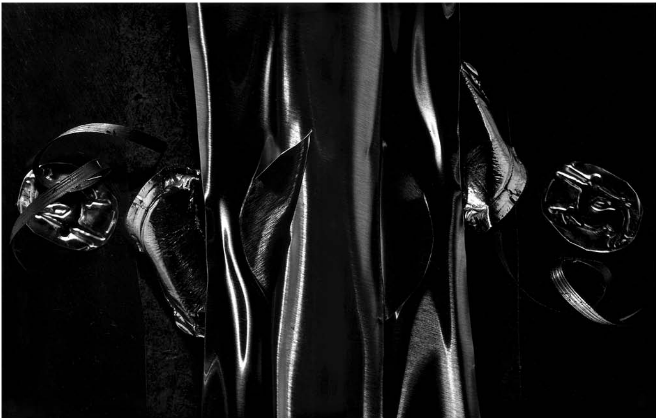
Untitled Diptych, 99, 92, 2007. 14 x 22 inches. Gelatin silver prints.

Nature is not picturesque, it is often ugly and unruly, which is why one has to struggle to make a photograph