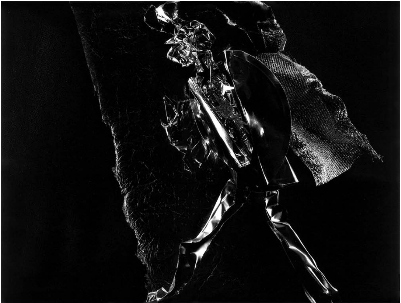
Peace Warrior (Don Quixote) 188, 2003. 36 x 48 inches. Gelatin silver prints.

out in it. By working in the studio, I have control over the light and its effect on the collage. This allows me to alter that relationship in a manner similar to how I burn and dodge in the darkroom.